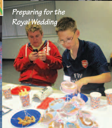
Preparing for the Royal Wedding