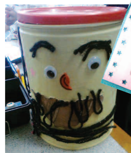
Craft project examples

The course content was devised after an initial questionnaire to our members and