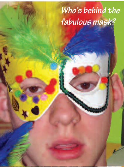
Who's behind the fabulous mask?