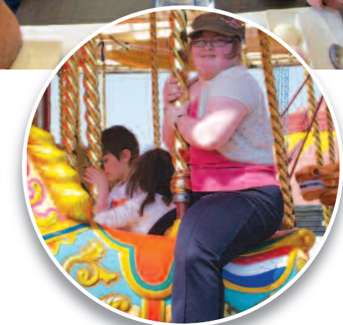
donations in support of Adult Adventurers.

Adult Adventurers Summer Programme starts on Monday July 25th with a