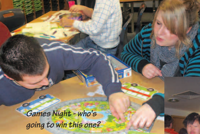
Games Night - who's going to win this one?