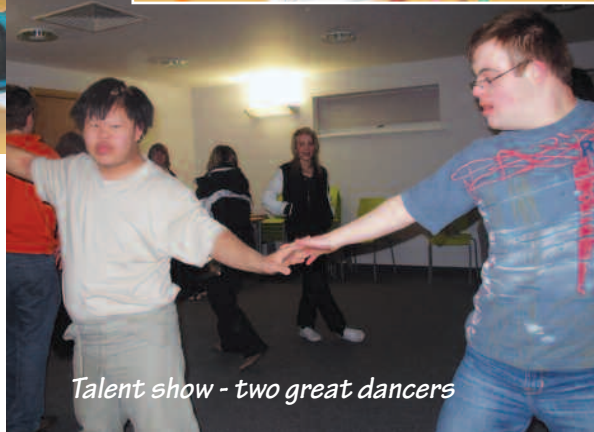
Talent show - two great dancers

Bored? Want to get away from Mum and Dad for a while and have fun with people your age? Looking to make new friends? Then come and try out the Chelmsford Mencap Youth Club.