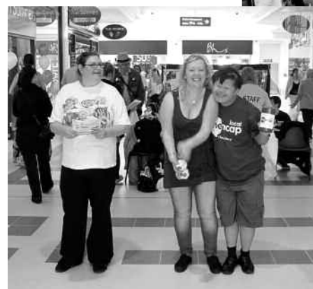
Some of the 26 volunteers who manned the stall throughout the day and collected £400 for the charity.

The Chelmsford Mencap Stall in the Meadows with a colourful display board, information material and merchandise.